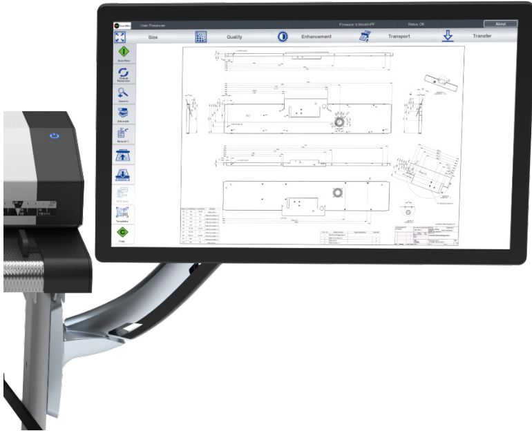
Full HD monitor with adjustable monitor arm mounted to the side of a WT36/48/60-STAND